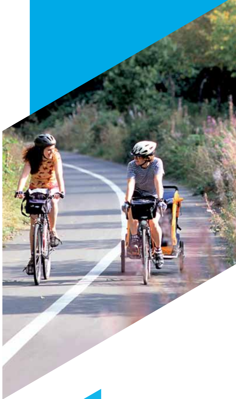
Natural England / Doorstep Greens

It can also generate more effective working partnerships between the local authority and residents. The experience of community-led open space improvement projects funded through the 'Transforming your space' lottery programme, for instance, found that people learned how their council worked and became more trusting and open to dialogue. The council gained a better understanding of community groups and their ability to take responsibility for improving the local environment. Community groups became stronger and more confident, with many groups adopting a can-do attitude, gaining credibility and raising local aspirations.