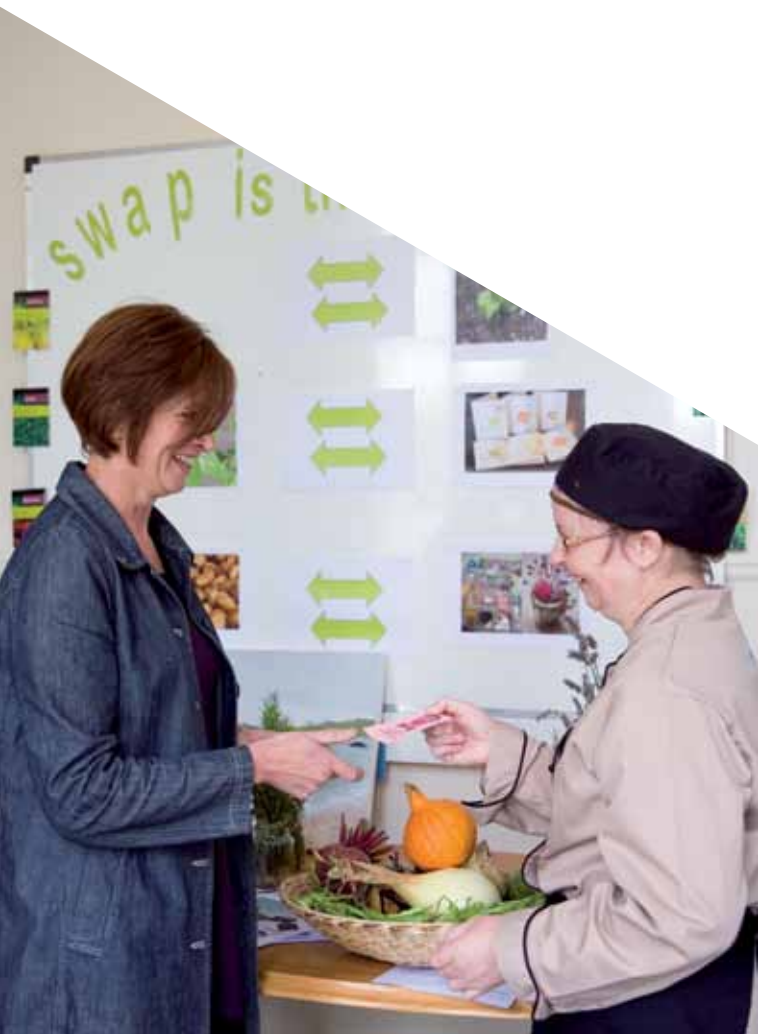
Bayley Hall Café, Hyde Park Manchester